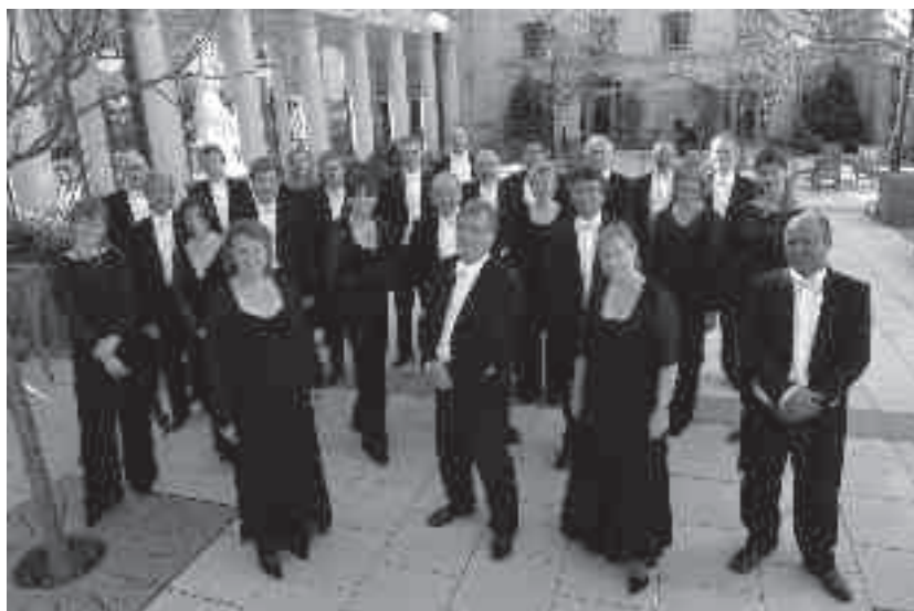
Academy of St Martin in the Field