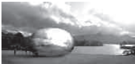
A simulation of DROP at Derwent Water, © Steve Messam

DROP is a newly commissioned giant inflatable sculpture conceived by Eden artist, Steve Messam. The reflective work will be launched on 11 September and is based on a raindrop - the building block of the lakes.