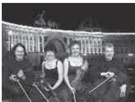
St Petersburg Quartet