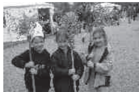
Children with their hand-made brooms

Further details of Apple Days throughout the county are at www.nationaltrust.org.uk