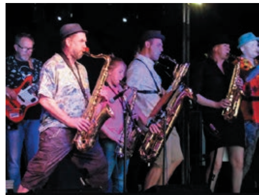
Guns of Navarone UK/MORCAMBE