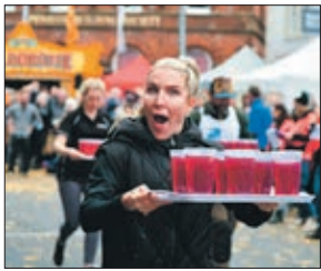
FUN AND GAMES: The Drover's Cup.