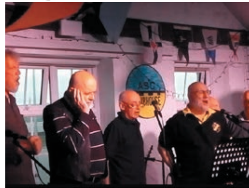
Nobody's Friends UK/CUMBRIA