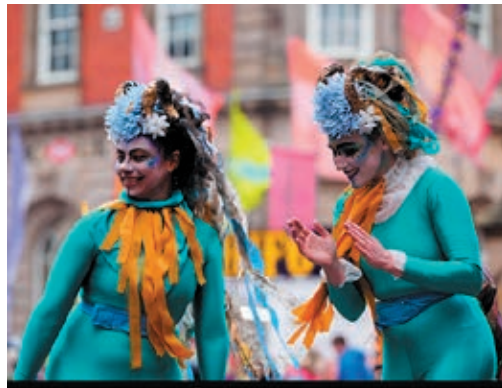
Matrix Circus UK/CUMBRIA