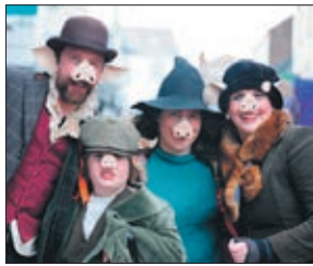
PIGGY-WIGGY WOO: Onlookers get into the spirit.

SCORES of people from Keswick popped over to Penrith on Saturday night to watch the Winter Droving parade weave its way through the town.