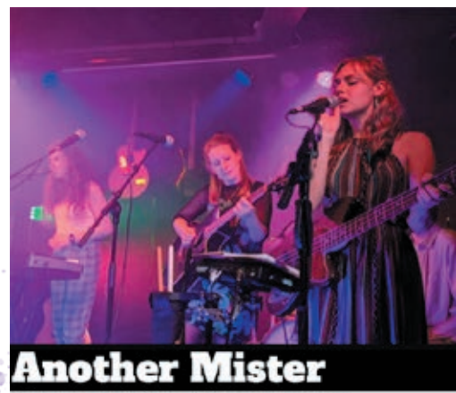
Another Mister UK/CUMBRIA