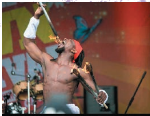
African Acrobatics Circus UK/STAFFORDSHIRE