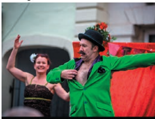
Other Half Productions UK/LONDON