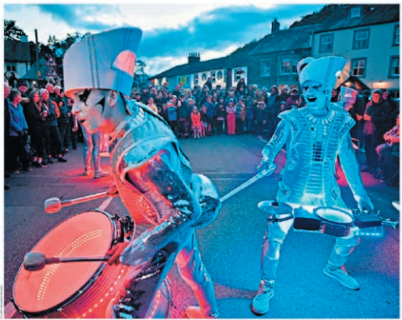
Let there be light. LED-clad drummers from theatre group Spark! perform on Saturday in Pooley Bridge, Cumbria, where they lead a parade of illuminated entertainers through the village. The brightly lit procession was part of Ullswater Droving, an annual event that celebrates the changing of the seasons.

Eden Arts will be working with colleagues at the internationally renowned outdoor arts organisation Walk the Plank with a unique opportunity to participate in creating a magical artwork in Pooley Bridge using Geolights as featured on BBC Countryfile.