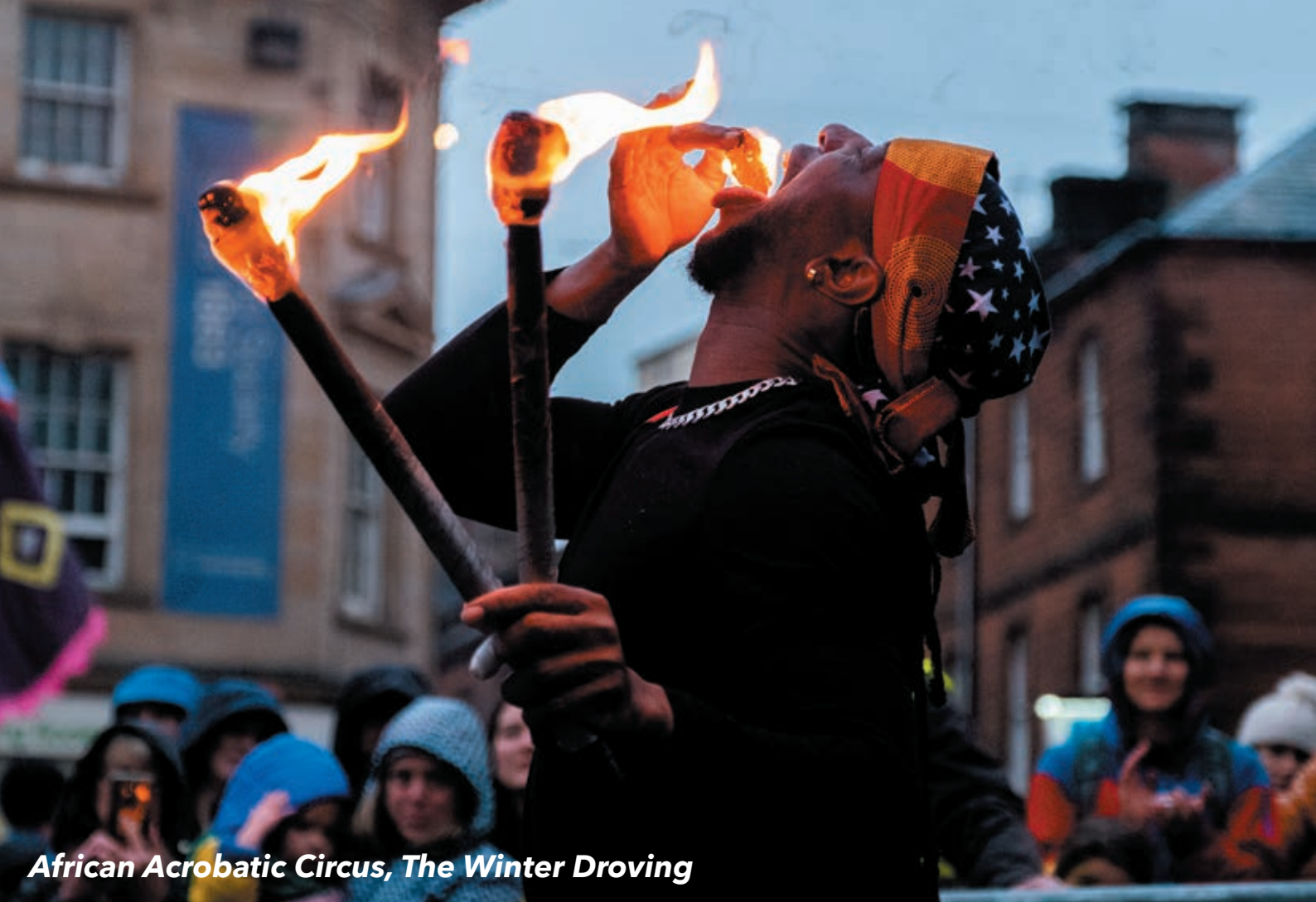
African Acrobatic Circus, The Winter Drovng