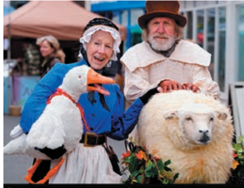
Shepherd and Goose Woman UK/LANCASTER