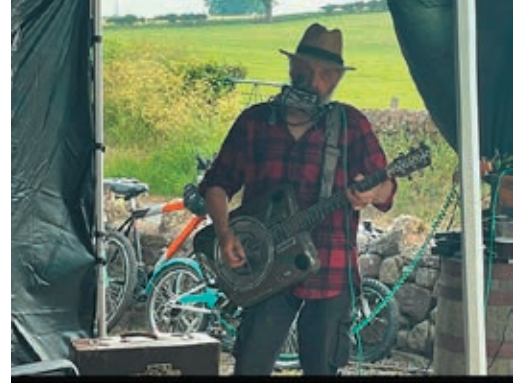
Uncle Carbunkle UK/CUMBRIA