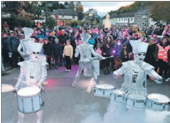
FOLLOW THE BEAT: Performance drummers Spark! entranced the crowds at Pooley Bridge on Friday as the Ullswater Droving got under way. Full story and pictures — Page 3.

event, organised by Eden Arts, which pulls in people from near and far in a celebration of farming, history and rural life. Full report and more pictures on Page 3.