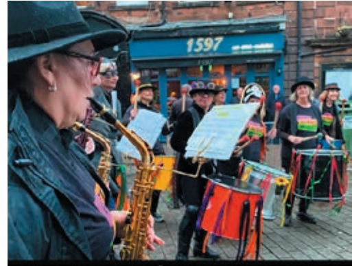
Blue Jam Street Beats UK/CUMBRIA