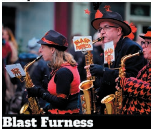
Blast Furness UK/CUMBRIA