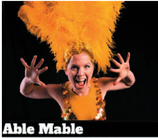
Able Mable UK/CARDIFF