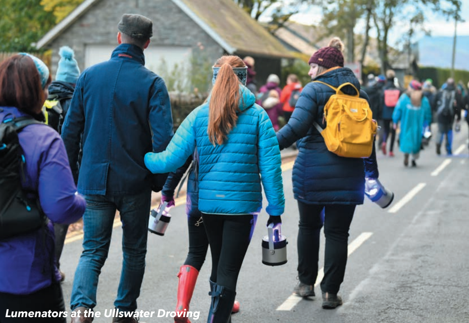
Lumenators at the Ullswater Droving