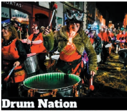
Drum Nation UK/CUMBRIA