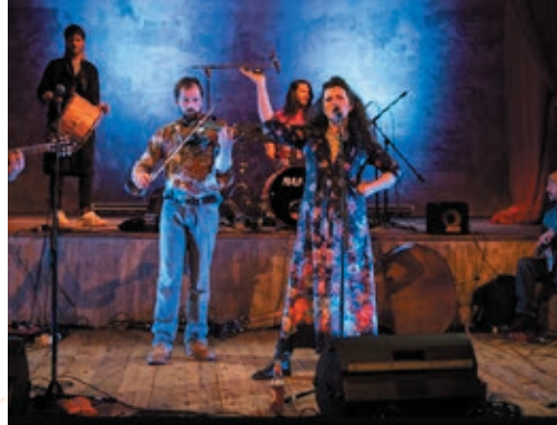
The Odd Beats UK/INTERNATIONAL