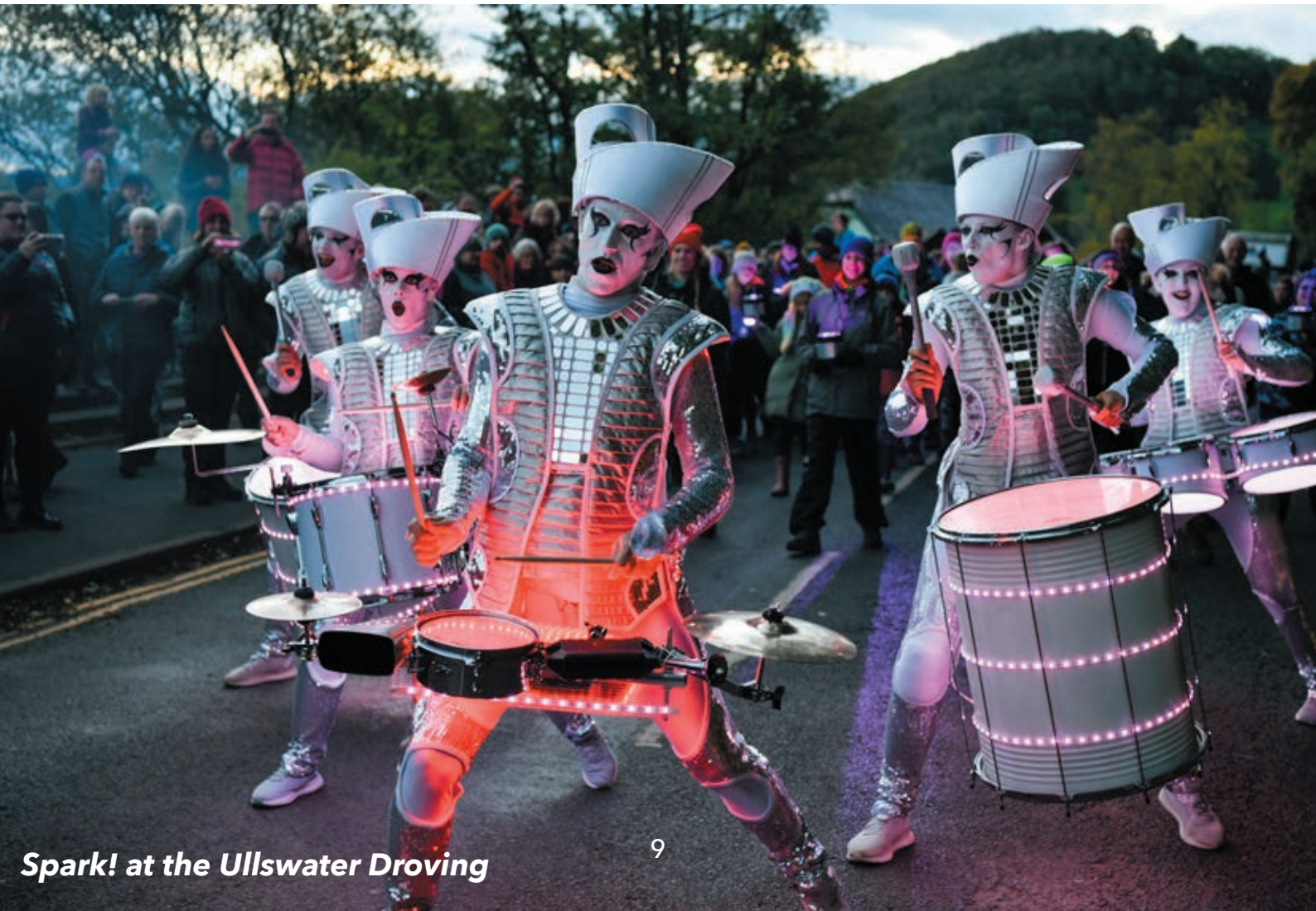
Spark! at the Ullswater Droving