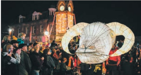
DROVE ALL NIGHT: The beasts on the move through Penrith town centre.