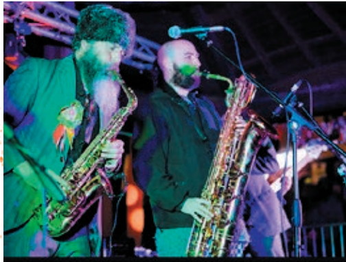
The Baghdaddies UK/NEWCASTLE